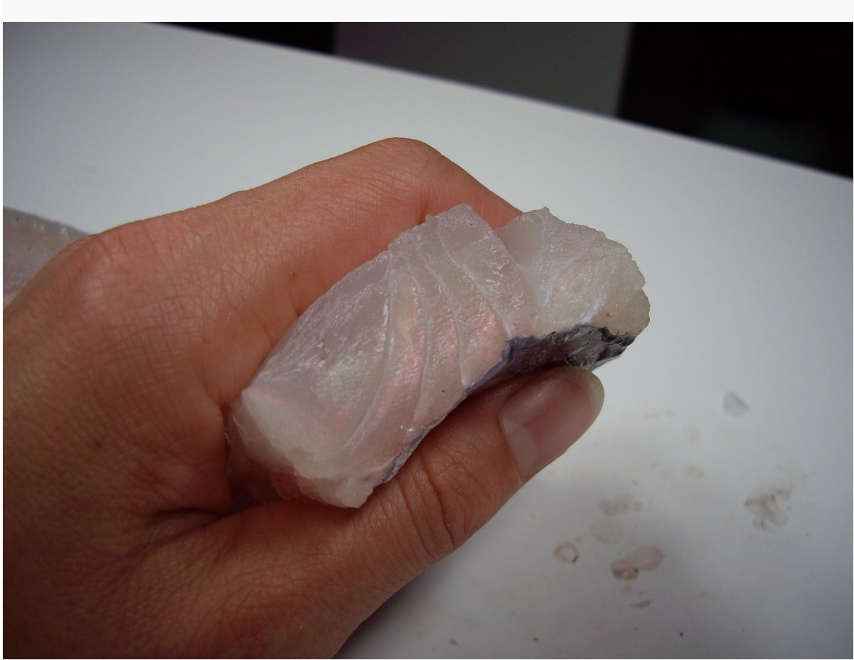
Figure 2. The translucent quality of PSH caught hoki.