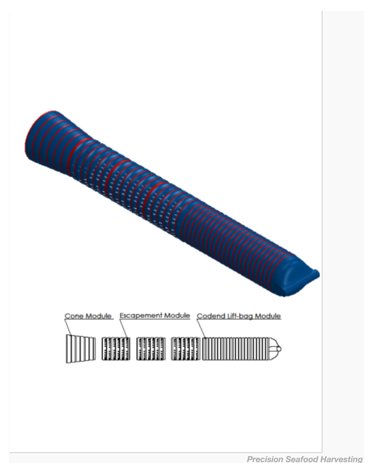
Figure 3. The Modular Harvest System configuration.

The critical mechanism is to control the water velocity within the modular harvesting system to within the stamina of the catch, allowing fish to regain control, individualise and look after themselves during the fishing event. The graded water flow inside the MHS is achieved with strategically positioned and sized escapement ports along the length of the MHS to allow water (and undersize catch) to escape. The PSH PGP programme set out to